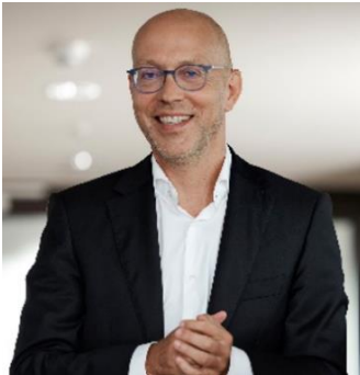
JÖRG ASMUSSEN CEO German Insurance Association (GDV)

Jörg Asmussen has been an executive member of the Board of Management and Chief Executive Officer of the German Insurance Association (GDV) since 1 October 2020. Before, he served as State Secretary at the Federal Ministry of Finance and at the Federal Ministry of Labour and Social Affairs. He also was a member of the Executive Board of the European Central Bank and worked for the US investment bank Lazard.