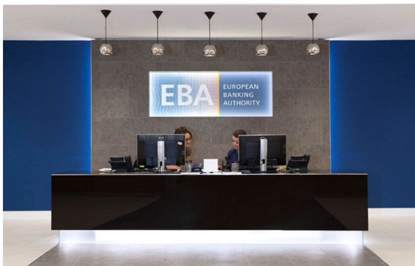
European Banking Authority (EBA)

One of the first deliverables was the Joint Position on Manufacturers' Product Oversight and Governance Processes in 2013. 1 Product oversight and governance (POG) processes refer to product manufacturers' internal processes, functions and strategies aimed at designing and bringing products to the market, and